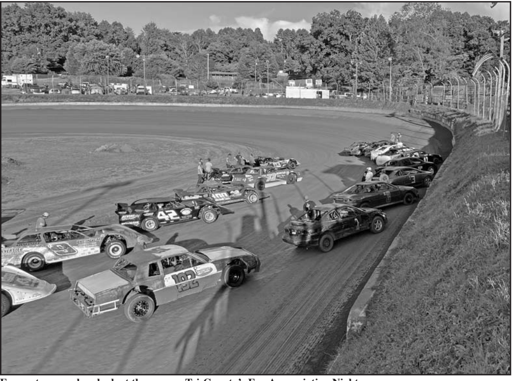
Fans get an up-close look at the cars on Tri-County's Fan Appreciation Night.