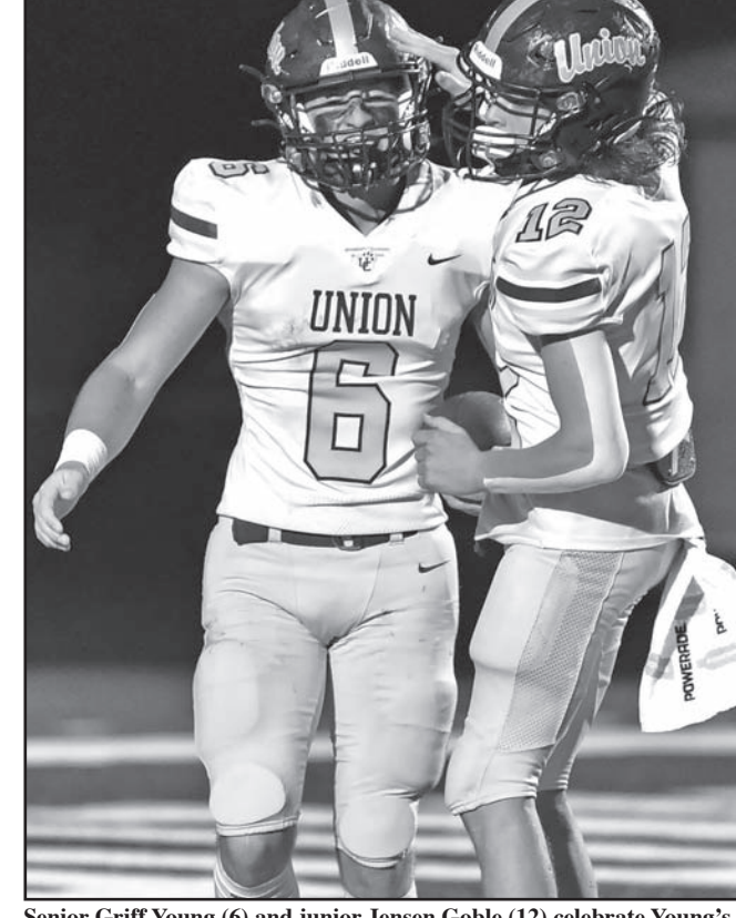
second-quarter touchdown catch. The duo combined for 10 catches, 163

While moving at will over the final three quarters, Union's moving inside the Union County offense found some tough sled- five after hitting a third-and-8 three-and-out after receiving coming down with a 24-yard the game's opening kickoff. The defense forced a three-and-out, snuffed out a fake punt from the Indians' 26-yard line.